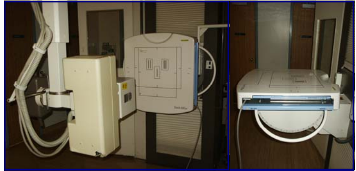
The Thormat Chest Unit, at Hamilton General, is also a room that was retrofitted to Canon DR. This retrofit allowed the Thormat to utilize all of its original features with the added versatility of performing general procedures due to the Rotating/Tilting Bucky (Pictured Right)

Company is listed as one of Fortune's Most Admired Companies in America and is rated #35 on the Business Week list of "Top 100 Brands." Its parent company Canon Inc. (NYSE:CAJ - News) is a top patent holder of technology, ranking third overall in the U.S. in 2004, with global revenues of $33.3 billion. For more information, visit www.usa.canon.com .