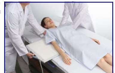
One of the two new rooms at McMaster Children's Hospital is an Auto-Tracking System with three of Canon's digital plates. One plate specialized to pediatrics.

Since 1997, Canon Medical Systems, a division of Canon U.S.A., Inc., has introduced five generations of flat panel sensors (Canon CXDI-11, Canon CXDI-22, Canon CXDI-31, Canon CXDI-40G and Canon CXDI-