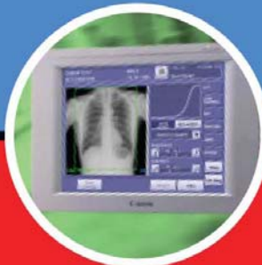
3-second results eliminate time-consuming and expensive repeats.