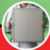
Big enough for full-sized chest and abdominal x-rays.