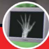
Superior image quality instantly at bedside.

By combining full-sized imaging and portability with an easy upgrade path, our new CXDI-50G fits into places you might never expect – including your existing equipment. For more information, call 1-800-970-7227, or visit www.usa.canon.com/DR . You'll see a whole new way to look at better patient care.