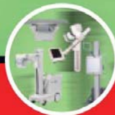
Upgrade with existing equipment.